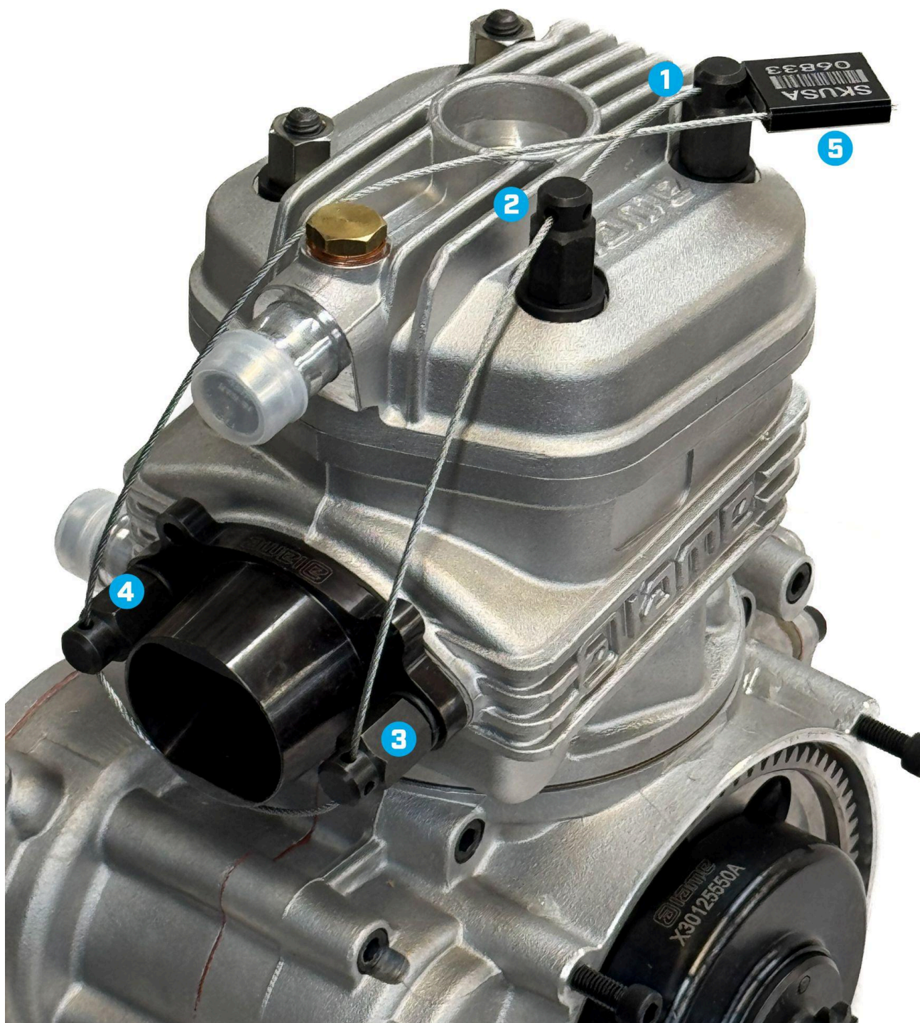
Engine Seal Installation