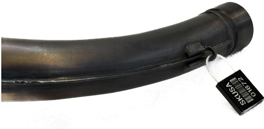
Pipe Seal Installation